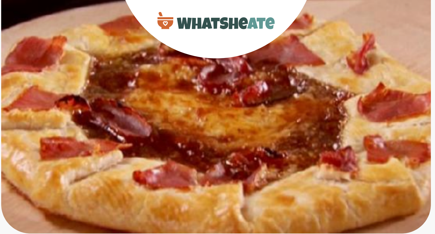
Fig and Prosciutto Crostata